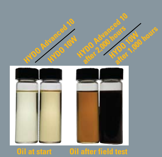
Improved Oil Stability

250% increase in oxidation stability per ASTM D943. Improved oil stability and wear protection make Cat Hydo Advanced 10 last longer.