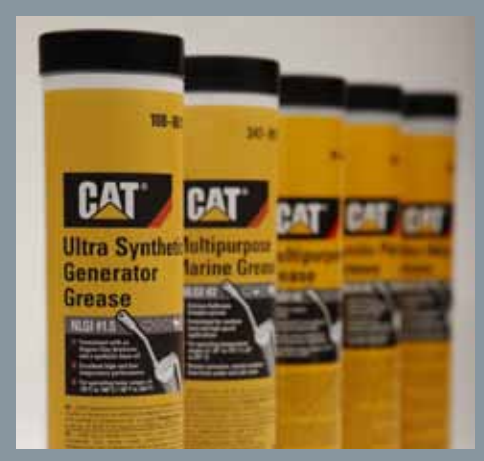
CAT® ULTRA SYNTHETIC GENERATOR GREASE