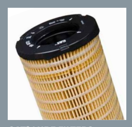
CAT® LUBE FILTERS