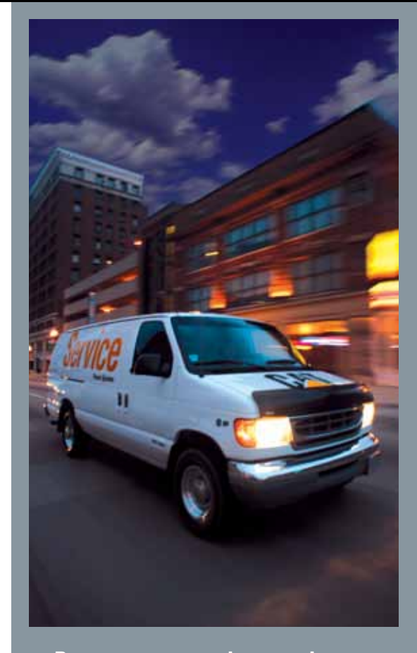
Protect your natural gas engine investment today.

PREMIUM: We provide all maintenance kits and perform all labor. Cat Product Link / Asset Watch subscription standard.